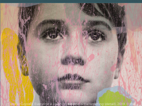
Debbie Godsell, Everyone is listening and time is transmitting (detail), 2019.

Our collection resource pack is full of information and classroom prompts! Click here to view