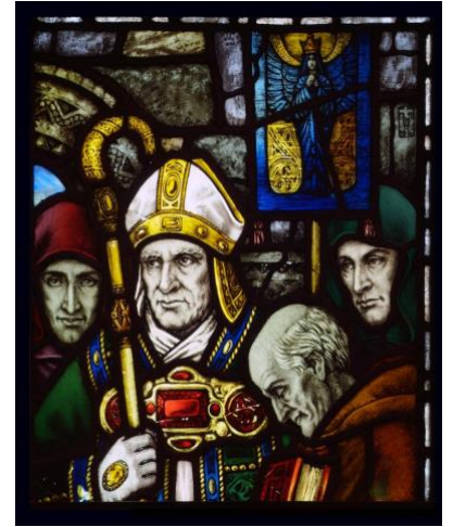
Harry Clarke (detail) The Consecration of St. Mel, Bishop of Longford, by St. Patrick , 1910, collection Crawford Art Gallery

Harry Clarke is a well-known Irish stained-glass artist who dedicated a lot of his work to churches around the country. Have you seen this artwork of St. Patrick?