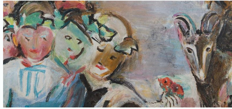
Sylvia Cooke-Collis, (Detail) Festival Scene , undated.