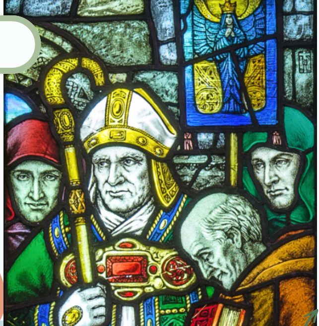
Harry Clarke (detail) The Consecration of St. Mel, Bishop of Longford, by St. Patrick , 1910, collection Crawford Art Gallery

She asked him for "as much land as her cloak could cover" and after the king agreed, her cloak magically grew to cover many acres of land!