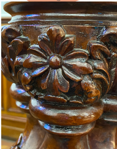
Detail of main staircase, c.1884

Hint: Keep an eye out for the small stuff!