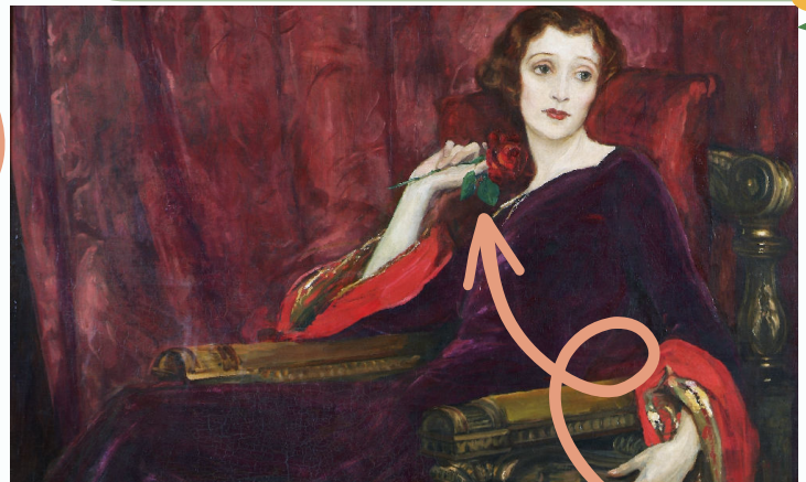
John Lavery, (detail) The Red Rose , 1923, collection Crawford Art Gallery