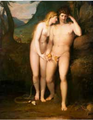
James Barry, The Temptation of Adam, 1767-1770